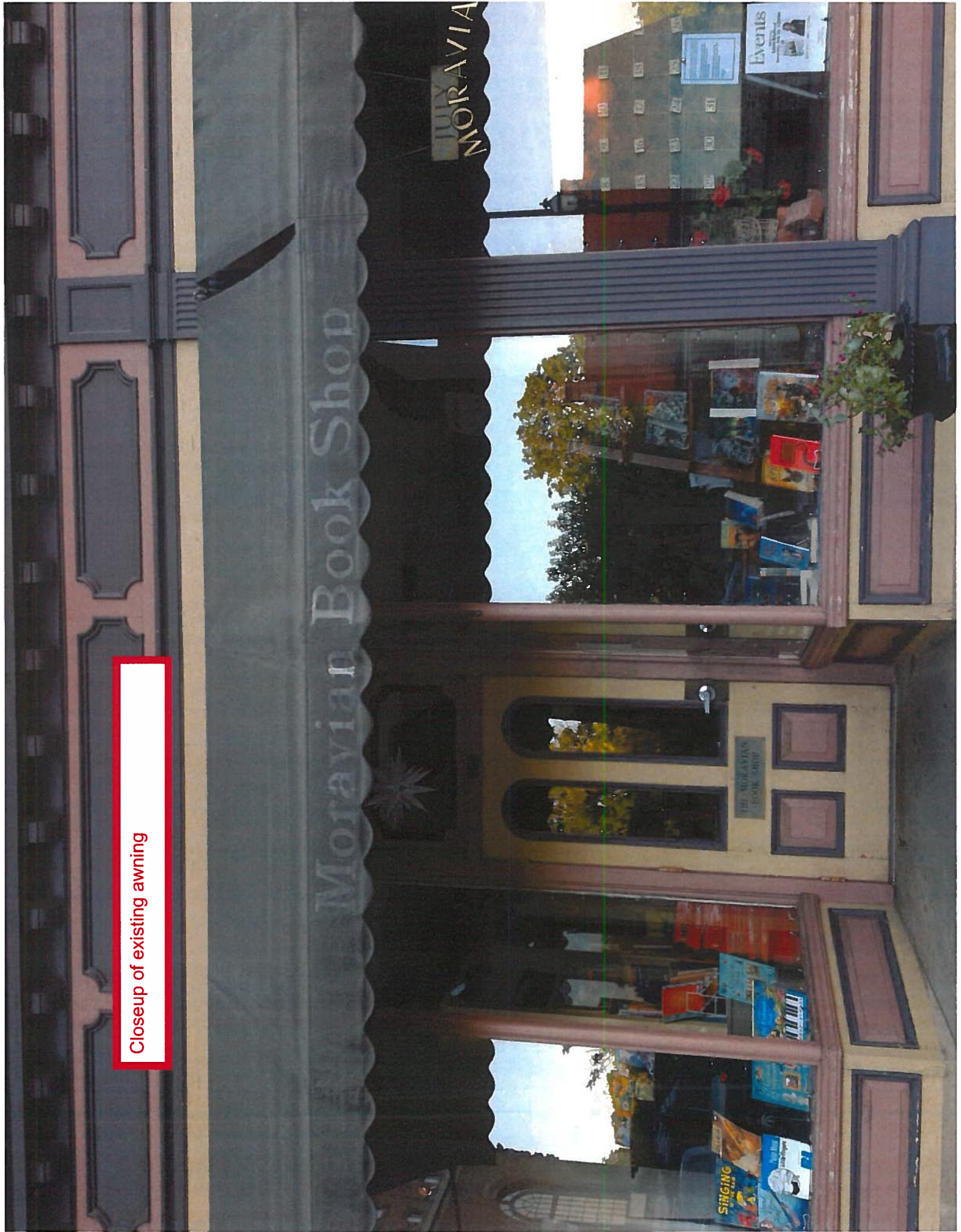
Closeup of existing awning